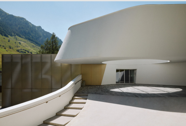
7132 - House of Architects