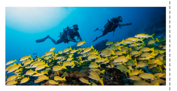
Get ready to make lasting memories.