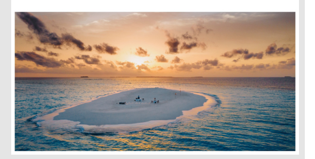
Ready to go? Me too!